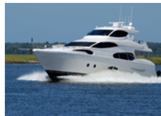
Yachts, Sailboats, and Ships