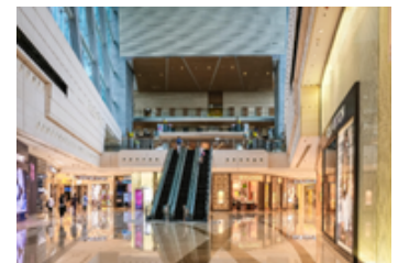
Waiting Areas, Shopping Malls, Hotels