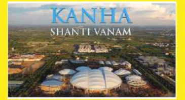
SRCM Heart fulness Meditation Center KanaH Shanti Vanam