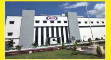
NATCO Pharma Ltd