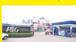
P & G