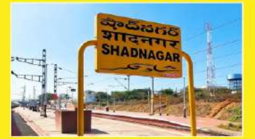
Shadnagar Railway Station