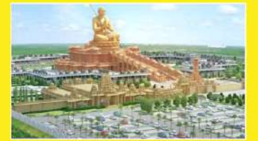
Statue of Equality