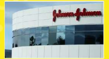
Johnson & Johnson