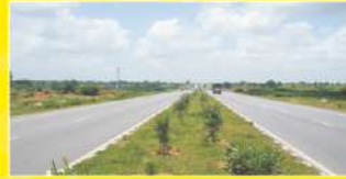
Bangalore Highway (NH-44)