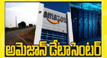
Amazon Data Center