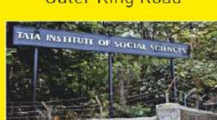
Tata Institute of Social Science