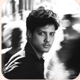
Founder Multidisciplinary Designer AI Generalist