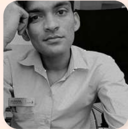
Co-Founder Web Dev LLM trainer