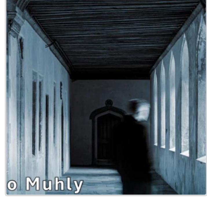
Nico Muhly: With Eys Lift Up / Choir of Magdalen College Oxford