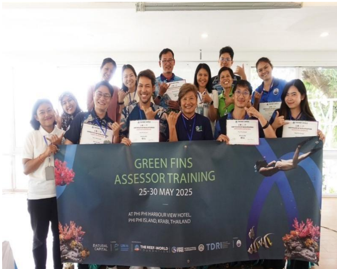
Figure 3 Green Fins assessor training