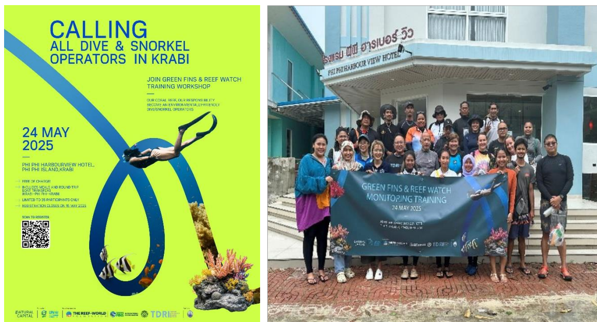
Figure 2 Green Fins and Reef Watch monitoring training for dive and snorkel operators