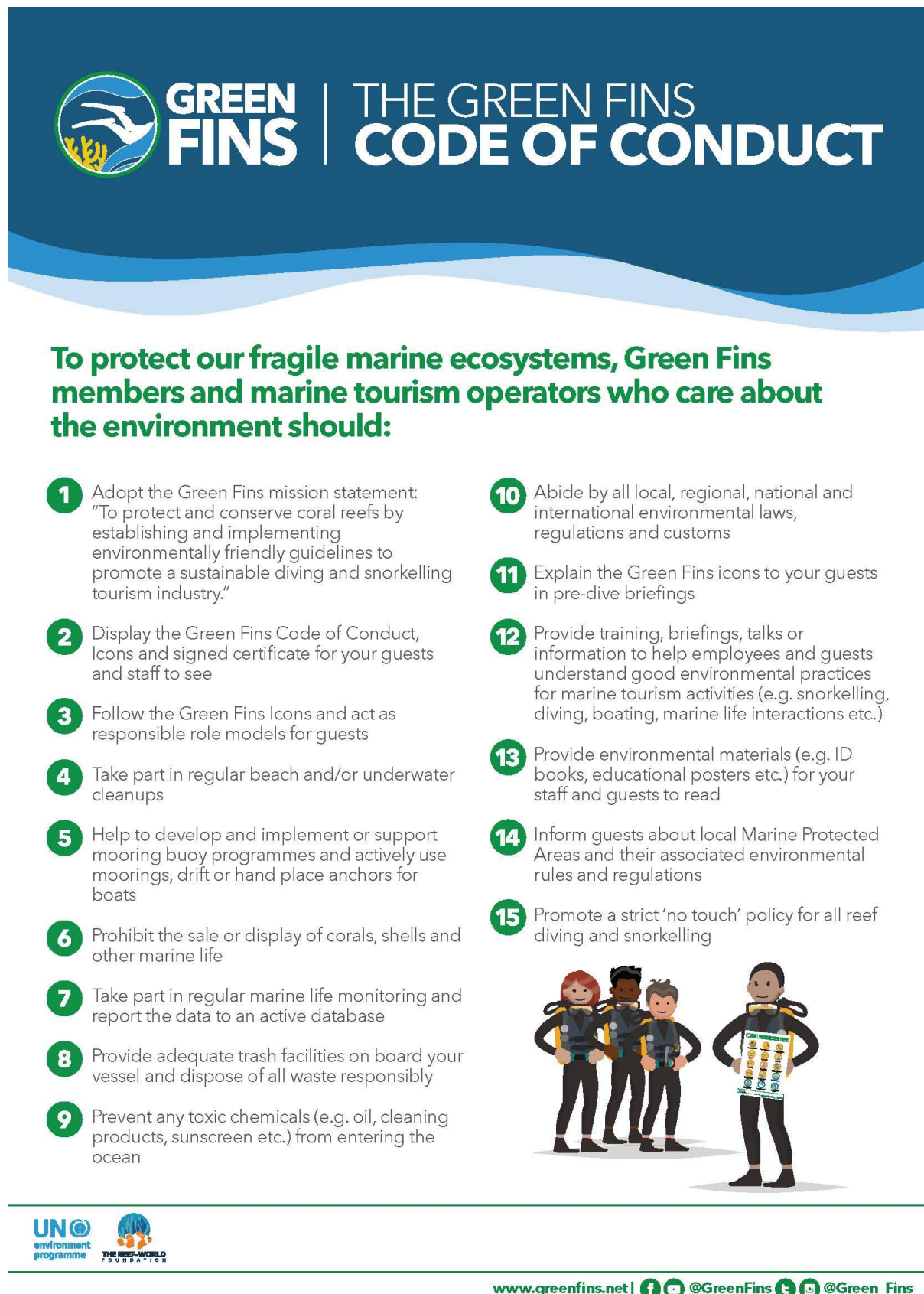
Figure 1 The Green Fins code of conduct