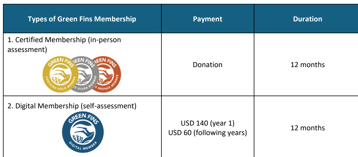
Table 1 Types of Green Fins Membership

Source: Adapted from Certified membership, by Green Fins, n.d. (greenfins.net).