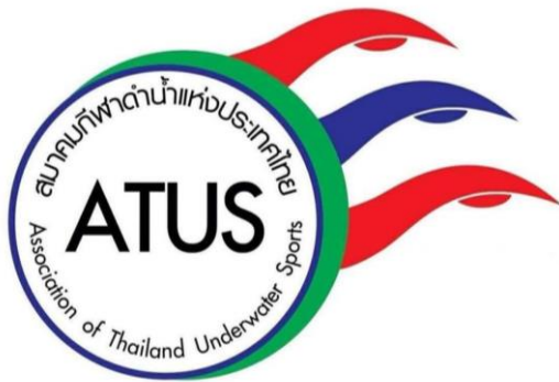
Figure 4 Association of Thailand Underwater Sports (ATUS)