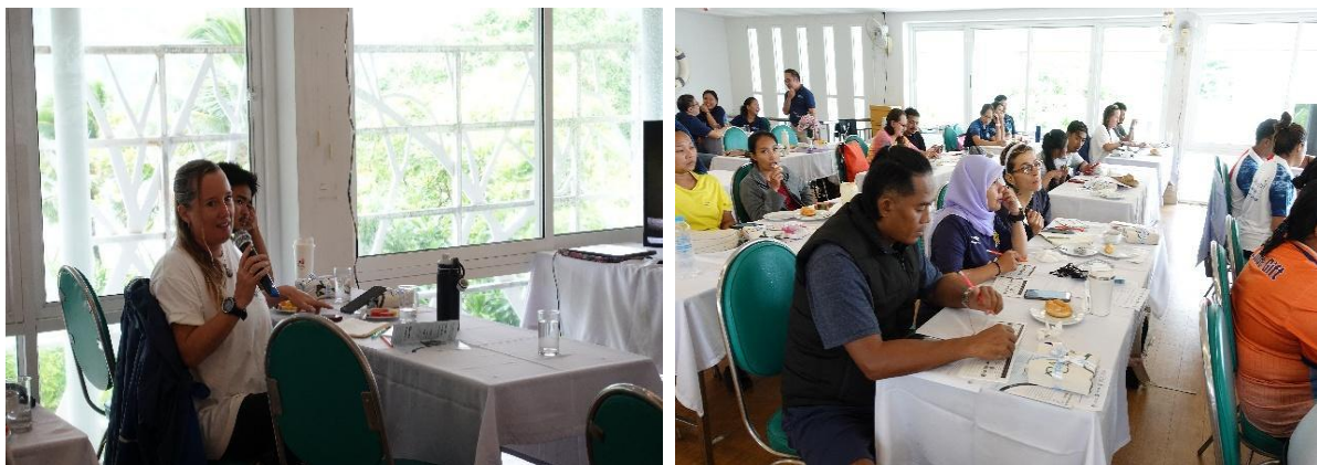
Figure 5 Dive and snorkel operators reflect on Benefits of Green Fins Certification