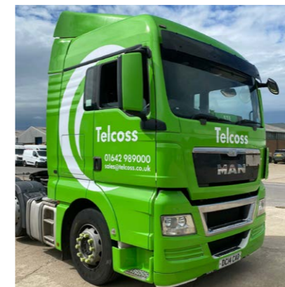
Telcoss vehicle fleet full cab wraps

Sign Design GB use premium grade 3M, Avery Dennison, Arlon and Image Perfect vinyl to ensure that your fleet or vehicle livery not only looks the part but well and truly stands the test of time; this can be combined with high quality digitally printed solutions when required.