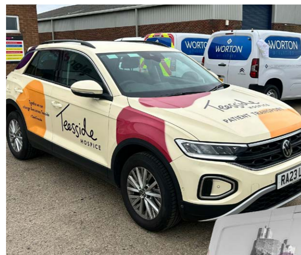
Teesside Hospice full vehicle wrap

A part wrap can give your vehicle and company the wow factor without the cost implications of a full wrap. This can include the rear doors only, rear doors plus the rear quarter sides, or the rear doors plus the full panel sides. Cut vinyl details such as phone numbers or other contact information and tag lines can also be mixed in to the overall scheme.