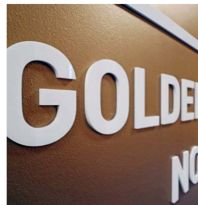
CNC cut acrylic lettering