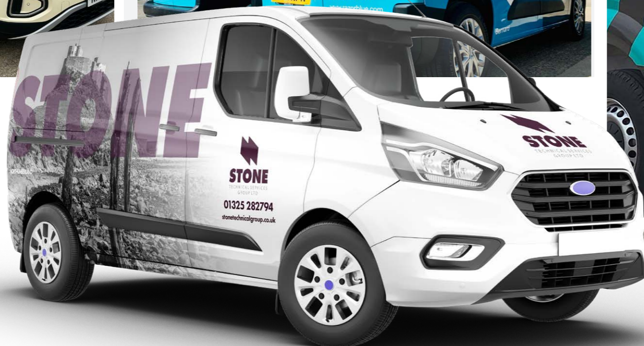
Bespoke branded customer requests