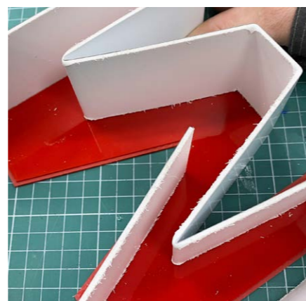
Three dimensional built up lettering