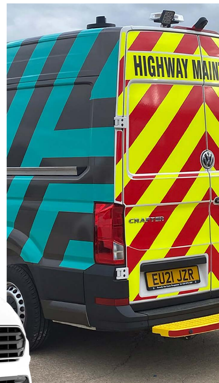
Applebridge Family fleet with cut vinyl and Chapter 8 chevron kits