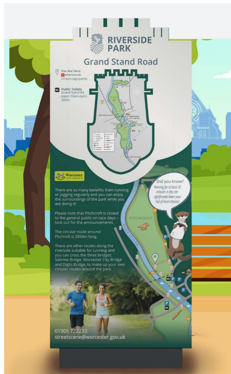
Worcester City Council Totem