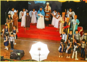
CHRISTMAS CAROL SERVICE 07.12.2024