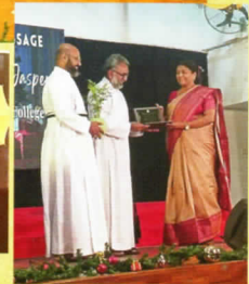
ASHA BHAVAN VISIT BY SEVIKA SANGHAM