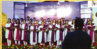
OUR CHURCH CHOIR WINS THE 2ND PRIZE AT SANGEETHA DHARA 2024 COMPETITION