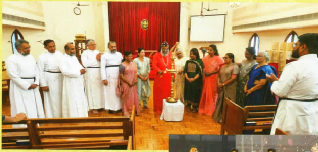
THE DIOCESAN SEVIKA SANGHAM INAUGURAL CUM ANNUAL ONE DAY RETREAT FOR SAKHA SECRETARIES HELD ON 16TH NOV, 2024 AT MMTSC CHETPET