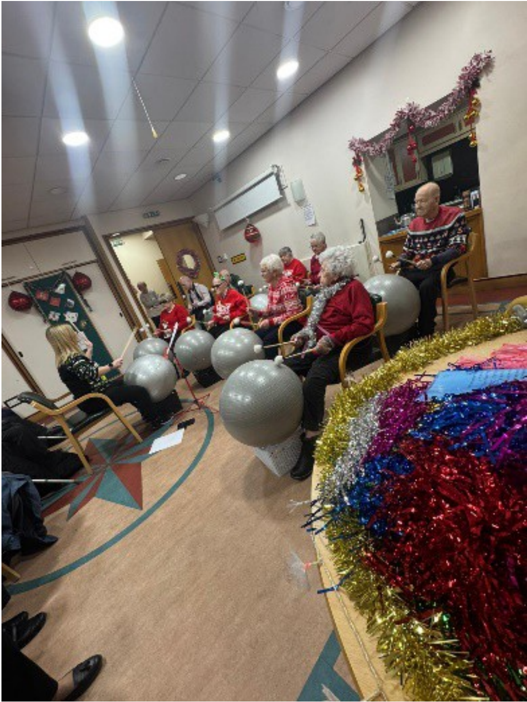
Christmas Extravaganza Seated Dancing