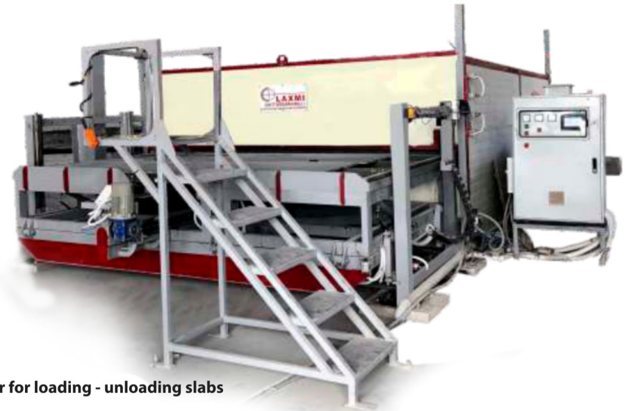
Ladder for loading - unloading slabs