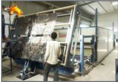
Loading- unloading from one side