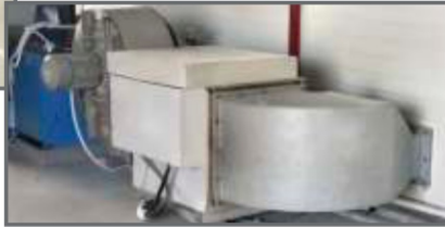
Blower & Heater bank