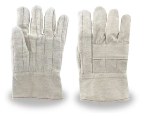
Natural Color, Regular Weight Hotmill, 100% Cotton, Band Top.