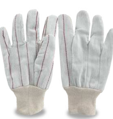
Natural Color, Corded Canvas Double Palm, Nap In, Knitwrist.