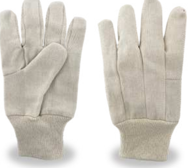
Natural Color, 8 oz Cotton Canvas, Wing Thumb, Knitwrist.