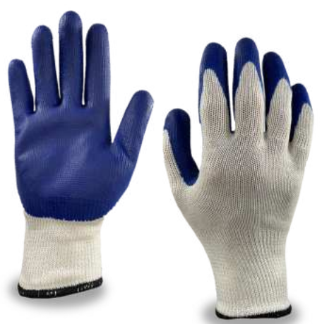
Natural Color, 10-Gauge Spun Polyester Shell, Smooth Blue, Latex Palm Coating. Sizes SM - XL