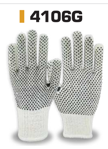
Natural Color, 7-Gauge, Standard Weight, Poly/Cotton Machine Knit, PVC Dots on 2 Sides. Sizes SM & LG.