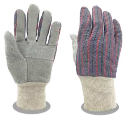
Cowhide, Regular Shoulder, Split Leather, Reinforced Palm, Knitwrist.