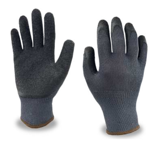
Gray, 10-Gauge Recycled Fiber Shell, Black Crinkle Finish Latex Palm Coating. Sizes SM - XL