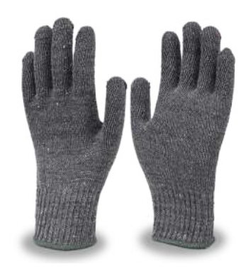
Gray, 7-Gauge, Standard Weight, Polyester/Cotton Machine Knit. Sizes SM & LG.