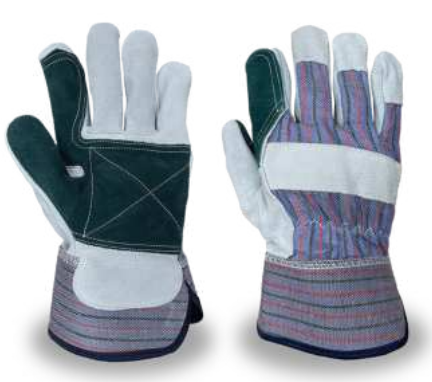
Cowhide, Standard Split Shouder, Leather Double Palm, 2 1/2" Rubberized Safety Cuff. Sizes SM - 2XL.