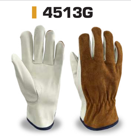
Cowhide, Select Shoulder Grain Leather Driver, Brown Split Back. Available in Gray Split Back - 4508G.