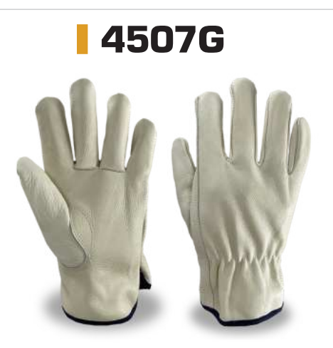
Cowhide, Standard Grain Leather Driver, Unlined, Keystone Thumb. Available in Industry Grade - 4506G.