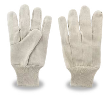
Natural Color, Heavy Weight, Cotton Canvas, Knitwrist.