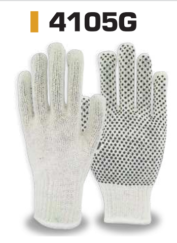
Natual Color, 7-Gauge, Standard Poly/ Cotton Machine Knit, PVC Dots on 1 Side. Sizes SM & LG.