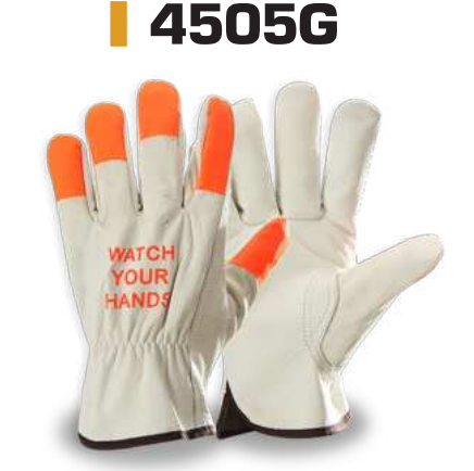
Cowhide, Standard Grain Leather Driver, Orange (Sewn On) FR Fingertips. Available w/ non FR Fingertips - 4515G.