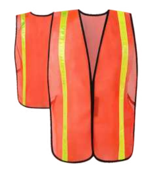
Non-Rated, Hi-Viz Orange, 1" Yellow Reflective Tape, Hook and Loop Closure.