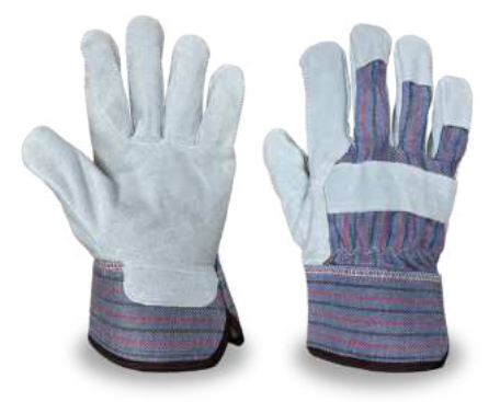
Cowhide, Shoulder Split Leather Palm, 2 1/2" Rubberized Safety Cuff. Sizes SM - 3XL.