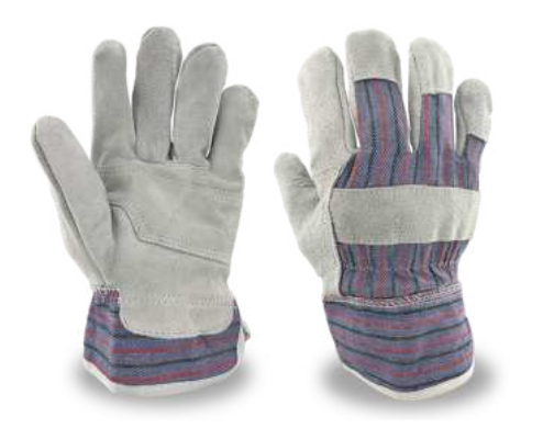
Cowhide, Split Shoulder Leather Patch Palm, Striped, Starched Safety Cuff.