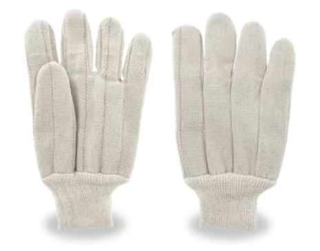
Natural Color, Canvas Double Palm, Nap In, Knitwrist.