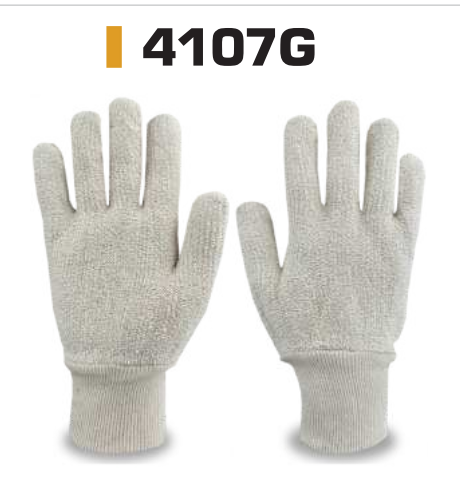
Natural Color, 24- oz, Loop-Out Terry. Knitwrist. Sizes SM & LG.