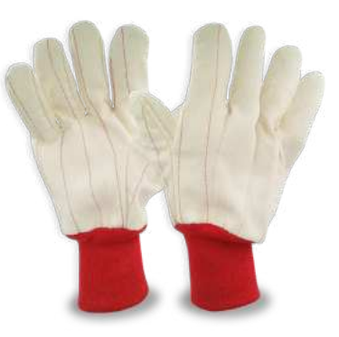
Natural Color, Canvas Double Palm, Nap In, Red Knitwrist.