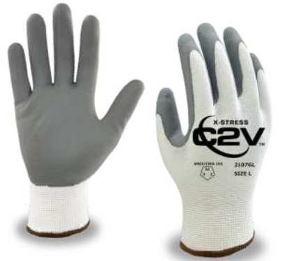
Gray Nylon Shell, Gray Foam Nitrile Palm Coated, Sizes XS-XL,