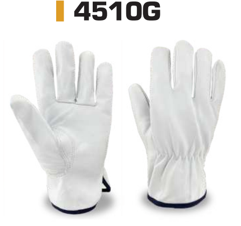
Goatskin, Premium Grain Leather Driver, Unlined, Keystone Thumb. Available in Industry Grade - 4509G.