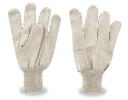
Natural Color, Standard Weight, Cotton Canvas, Knitwrist.