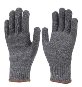
Gray, 7-Gauge, Heavy Weight Polyester / Cotton Machine Knit. Sizes SM & LG