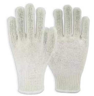
Natural Color, 7-Gauge, Standard Weight, Poly/Cotton Machine Knit. Sizes SM & LG