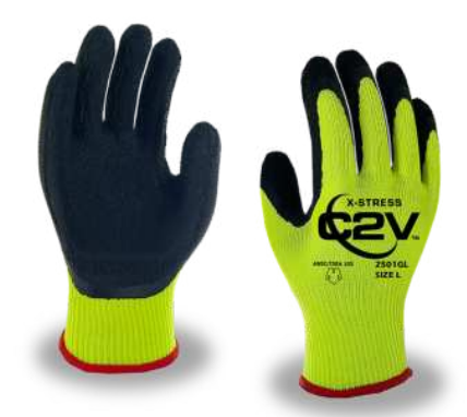
Hi-Viz Green High Tenacity Nylon Shell, Black Foam Latex Palm Coated Sizes SM-XL.