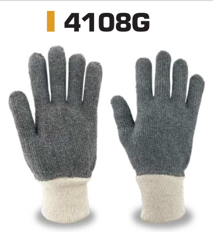
Gray Color, 24- oz, Loop-Out Terry. Knitwrist. Sizes SM, LG & XL.