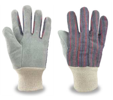
Cowhide, Regular Shoulder, Split Leather Palm, Knitwrist.