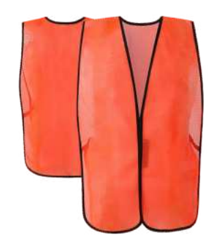
Non-Rated, Hi-Viz Orange, No Reflective Tape, Hook and Loop Closure.