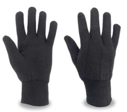
Brown Jersey, Standard Weight, Clute Cut, Knitwrist