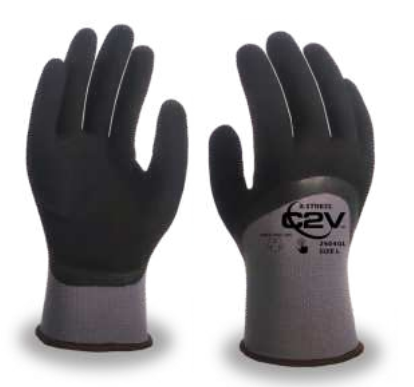
Gray Poly/Spandex Shell, Black Dual Coated - Flat Nitrile under Black Sandy Nitrile 3/4 Coated. Sizes XS-2XL. Also Available in Full Coated. 2405G