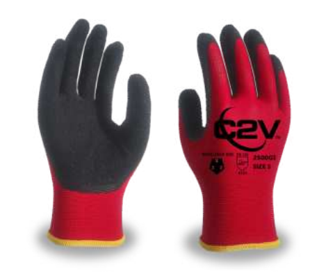
Red Polyester Shell, Gray Crinkle Finish Latex Palm Coated Sizes XS-2XL.