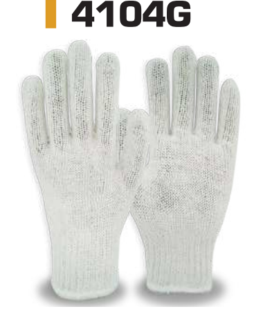
Bleached White, 7 Gauge, Standard Weight, Poly/Cotton Machine Knit. Sizes SM, MD, LG.