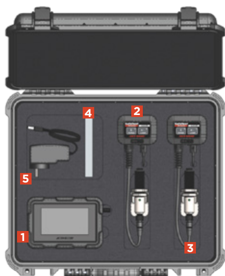
SafeTest TM 2 Channel Kit