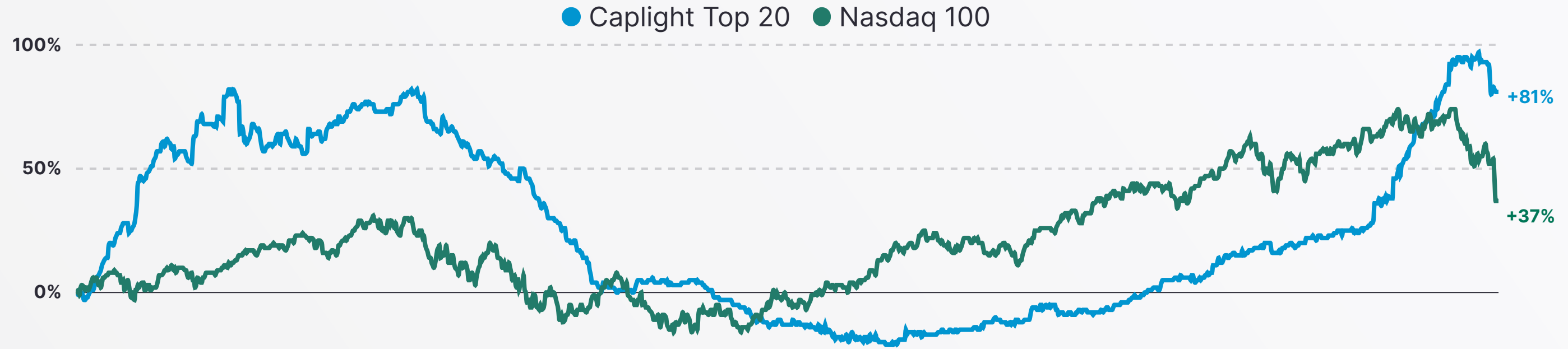
Price Performance since 2021: Caplight Top 20 vs. Nasdaq 100