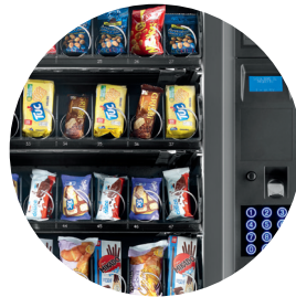
An elegant and uncluttered design