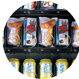
High visibility cell