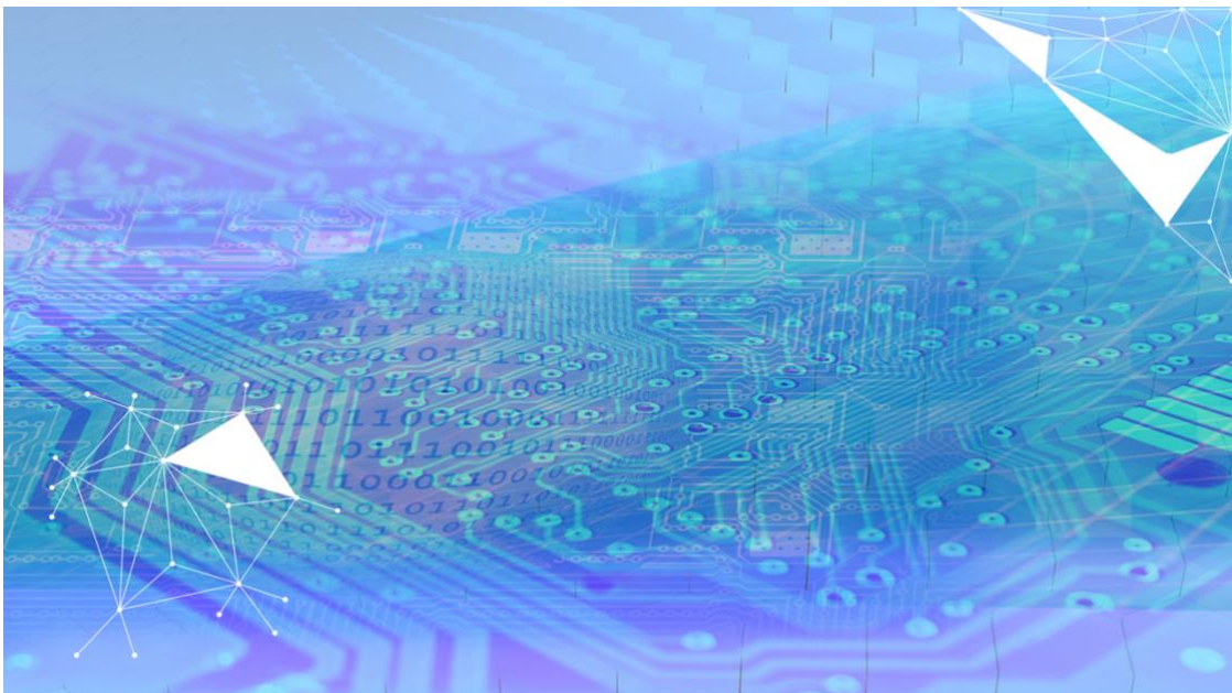
GoAP will identify internationally