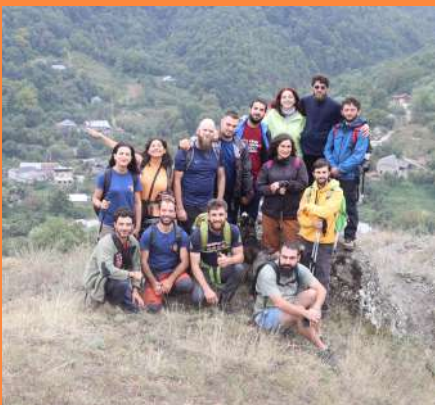
TFC's 7th Anniversary