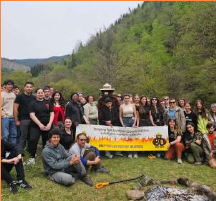
TOT Program and Smokey Bear's Visit in Mitarbi, Georgia