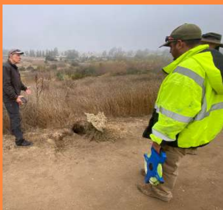
Experience Exchange and Training with Bellfree Contractors

Another hiking event was organized in collaboration with People in Need NGO to guide EU representatives and embassy workers along a section of the Legends Trail in the Syunik region. This was a great opportunity to discuss potential collaborations and strengthen connections while hiking a trail funded by the EU in 2020.