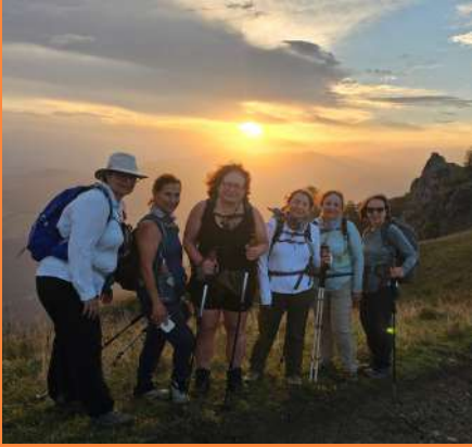
TCT Fundraising Hike

TFC supported the operation of the Transcaucasian Trail Fundraising Hike in Lori and Tavush regions. These kinds of tours are the best way not only to raise funds, but also to show hikers how important the connection between trails and communities is.