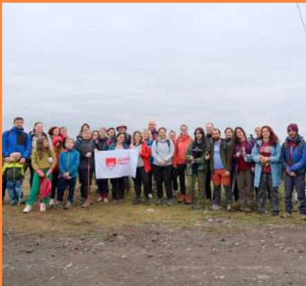
Legends Trail Hike

TFC supported the operation of the Transcaucasian Trail Fundraising Hike in Lori and Tavush regions. These kinds of tours are the best way not only to raise funds, but also to show hikers how important the connection between trails and communities is.