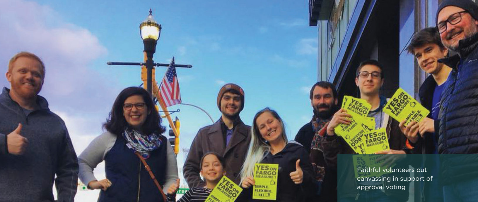
Faithful volunteers out canvassing in support of approval voting