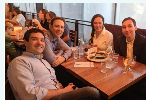
Chatting about voting methods over dinner with supporters in DC