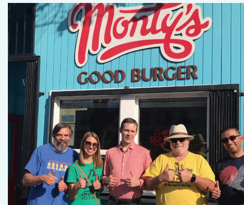
Enjoying some delicious burgers with supporters in LA!

Are you interested in joining us at an in-person event? Keep tabs on our events page and come see us the next time we're in your area!