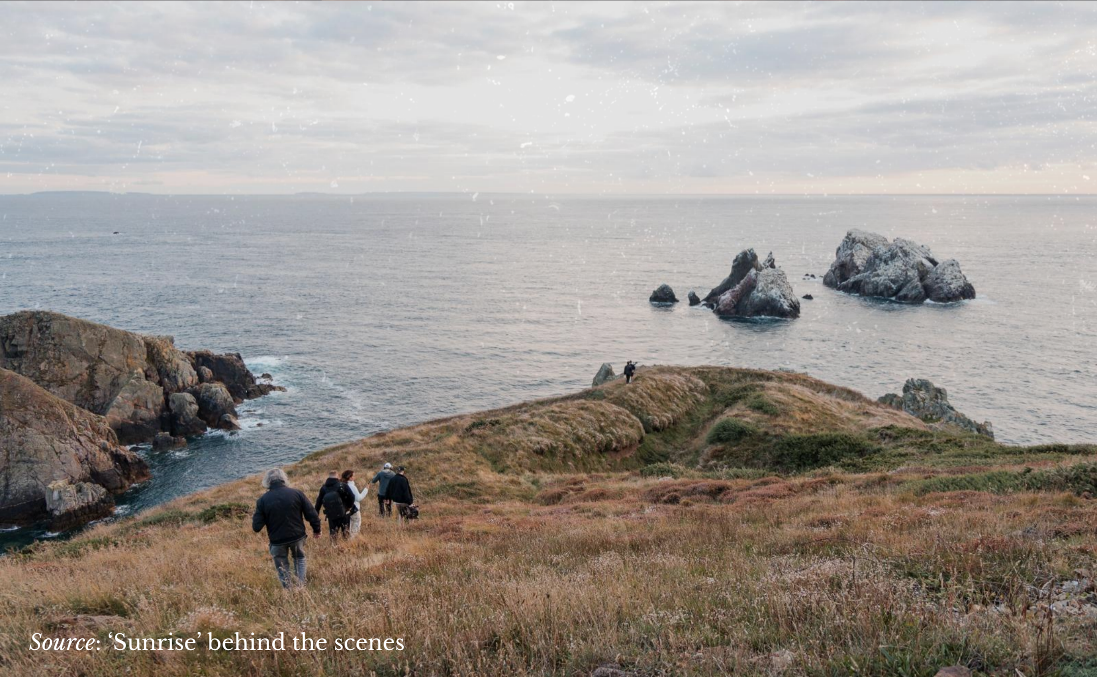
Source: 'Sunrise' behind the scenes