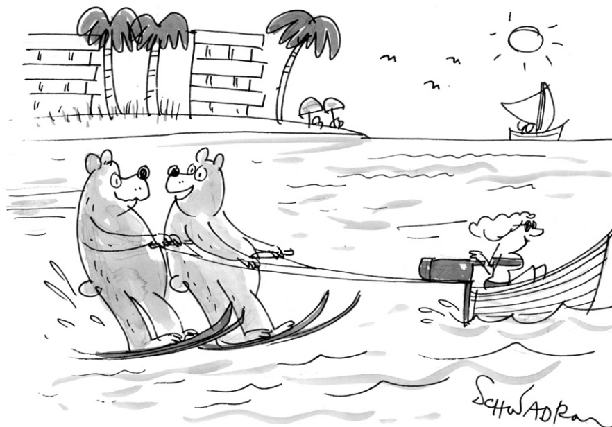
"And you wanted to hibernate!"