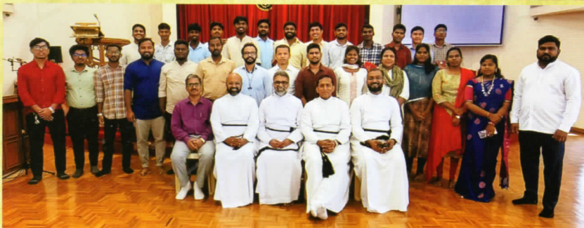
GURUKUL SEMINARY STUDENTS AND FACULTY