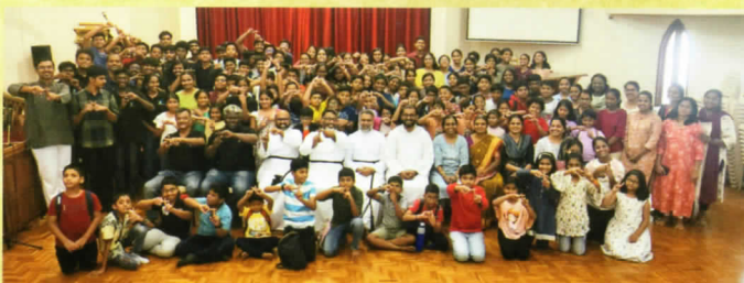
CHENNAI CENTRE SUNDAY SCHOOL CAMP ON 02.10.2024