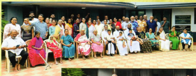
CHURCH CHOIR'S VISIT TO ASHA BHAVAN ON 31.08.2024