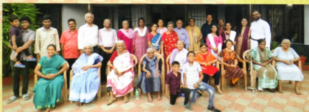
CHETPET PG VISIT TO ASHA BHAVAN ON 11.10.2024