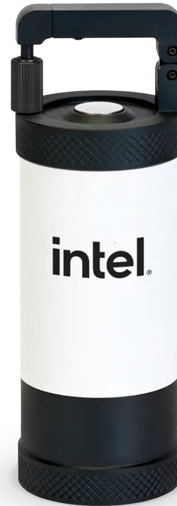
TUSK WHITE: 01-122-00W