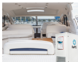
Yachts, Sailboats, and Ships