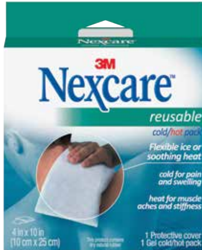
This Product Contains Dry Natural Rubber.