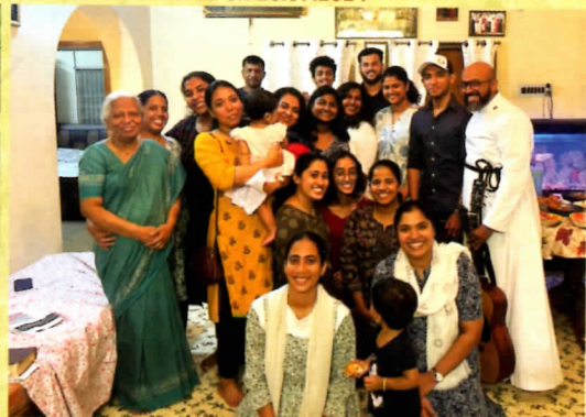
YOUTH CONNECT PROGRAM WITH THE AMINJIKARAI PRAYER GROUP YOUTH, ON 30.05.2024