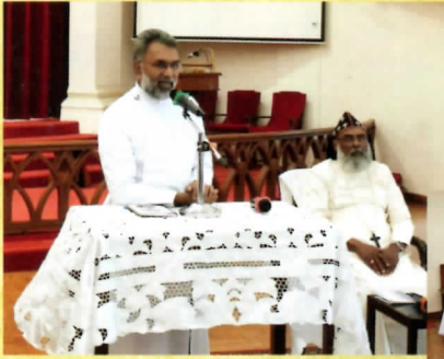
CHENNAI CENTRE CLERGY FELLOWSHIP ON 05.07.2024