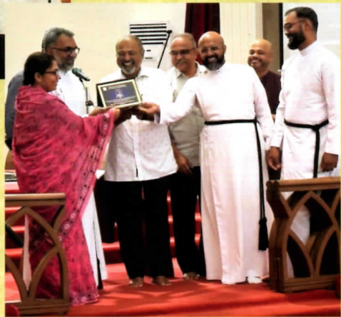
AMINJIKARAI PG VISIT TO SRIPERUMBUDUR ON 21.07.2024