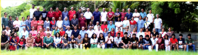
PARISH PICNIC @ VEDANTHANGAL ON 15.08.2024