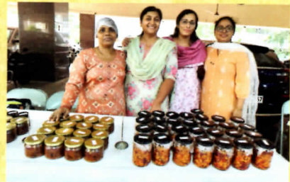
SEVIKA SANGHAM BREAKFAST SALE ON 28.07.2024