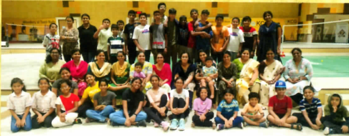
SUNDAY SCHOOL PICNIC ON 7TH JULY, 2024