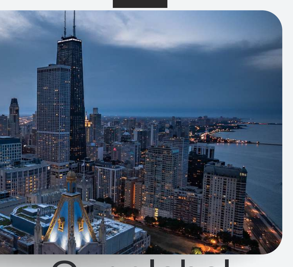
Our global clientele