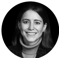
ANA CORINA SOSA Venezuelan advocate for freedom and human rights