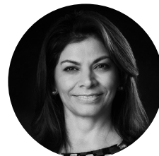
LAURA CHINCHILLA President of Costa Rica (2010–2014)