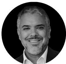
IVÁN DUQUE MÁRQUEZ President of the Republic of Colombia (2018–2022)