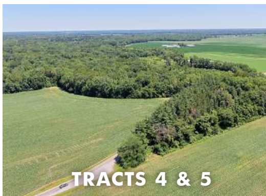
TRACTS 4 & 5