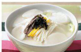
N4. 떡국 Tteogguksu soup with sliced ovals of rice-cake in clear beef broth