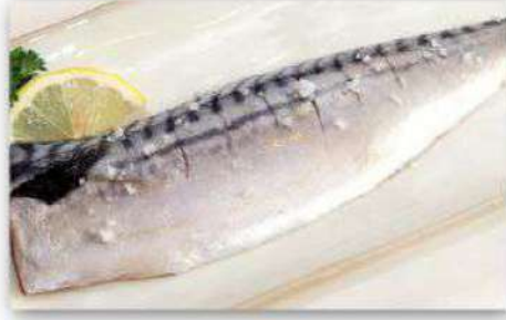
S3. 고등어 Godeungeo mackerel fish (120g/portion)