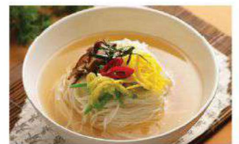
N3. 잔치 국수 Janchi-guksu thin noodle in a broth topped with zucchini & seaweed (warm)