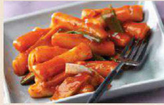
A4. 떡볶이 Topokki stir-fried rice cake, vegetables and fish cake in chili paste sauce