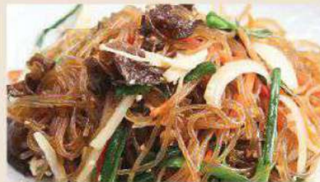
7. 잡채 Japchae pan-fried glass noodle, beef, carrot and spinach in seasoned soy sauce $15.00 (per portion) Original Price: $39.00