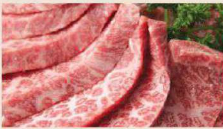
1. 꽃 갈비살 Kkot - galbisal boneless beef short rib wagyu grade $25.00 (130g/portion) Original Price: $69.00