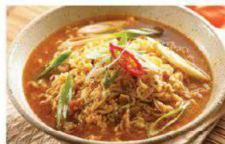
N5. 라면 Ramyeon Korean instant noodle