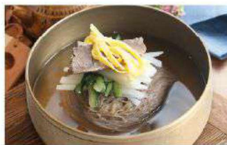
N1. 물 냉면 Mul-naengmyeon chilled buckwheat noodle soup (cold)