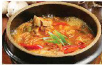
R1. 김치 찌개 Kimchi-jjigae spicy stew made with ripened kimchi, pork and bean-curd