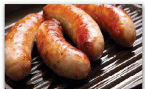
S1. 소세지 Sausage sausage (60g/portion)