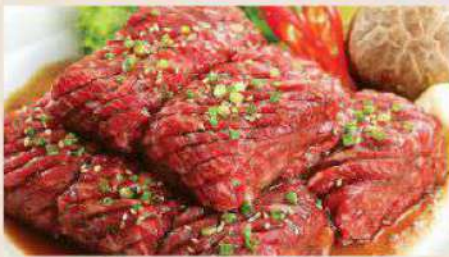
2. 서울 갈비 Seoul Galbi marinated beef short rib in seasoned sauce $30.00 (170g/portion) Original Price: $79.00