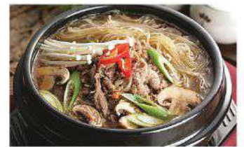
R6. 뚝 불고기 Bulgogi Bulgogi served in a hot stone bowl