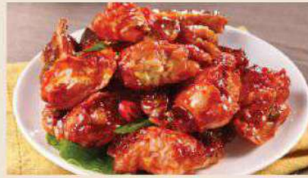
6. 양념게장 Yangnyeom-gejang Spicy Marinated Crab $19.00 Original Price: $39.00