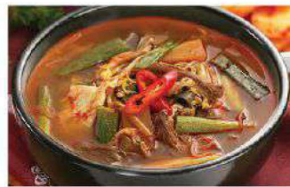
R5. 육개장 Yukgaejang Spicy soup made with beef, leek, bean sprouts and bracken