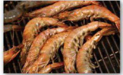
S4. 새우 Saewoo prawn (80g/portion)