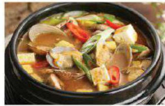
R2. 된장 찌개 Doenjang-jjigae soybean paste stew