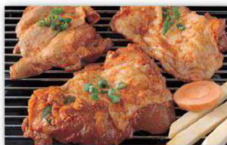
C2. 순한 치킨 Sunhan - chicken marinated chicken in seasoned soy sauce (70g/portion)