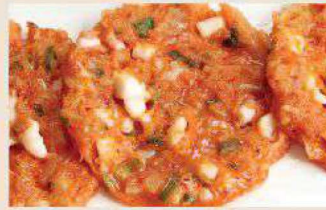
A2. 김치전 Kimchijeon Korean pancake made with finely chopped kimchi and squid