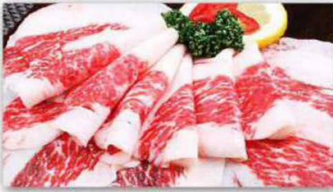
B1. 차돌박이 Chadolbagi thinly sliced beef brisket (70g/portion)