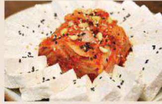
A5. 두부 김치 Dubu-kimchi sliced bean-curd served with stir-fried ripened kimchi and pork