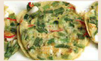
A3. 해물 파전 Haemul-pajeon Korean pancake made with spring onion, finely chopped squid and prawn