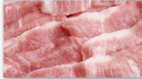
P2. 항정살 Hangjeongsal sliced pork jowl (80g/portion)