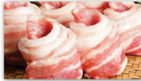
P1. 삼겹살 Samgyeopsal sliced pork belly (80g/portion)