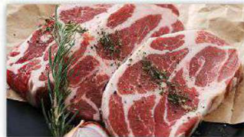
P4. 목살 Moksal (spanish Iberico) pork collar (70g/portion)