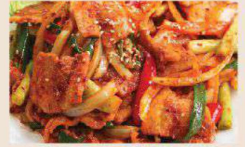
A6. 제육 볶음 Jeyuk-bokkeum pan-fried pork with onion in chili paste sauce