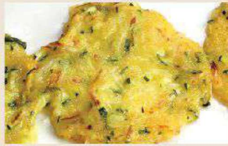
A1. 찹쌀호박전 Chapssal-hobakjeon Korean pancake made with julienned zucchini