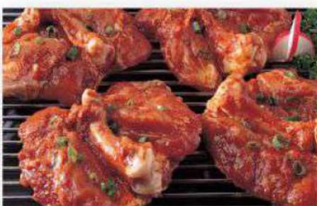
C1. 매운 치킨 Maewun - chicken marinated chicken in hot & spicy sauce (70g/portion)