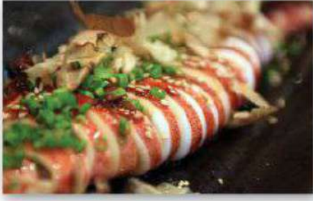
S2. 오징어 Ojingeo squid (80g/portion)