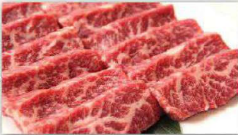
B3. 갈비살 Galbisaal boneless beef short rib (80g/portion)