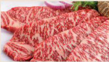
3. 등심 Deungsim beef rib-eye wagyu grade $40.00 (160g/portion) Original Price: $109.00