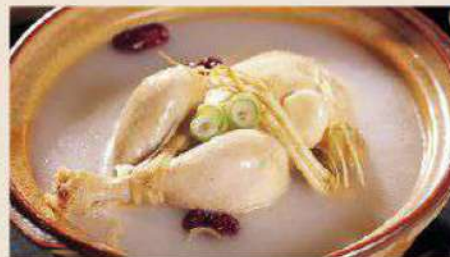
9. 삼계탕 Samgyetang Korean ginseng chicken soup $20.00 (per portion) Original Price: $38.00