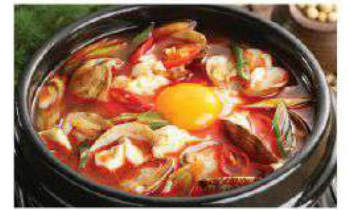
R3. 순두부 찌개 Sundubu-jjigae spicy soft bean-curd stew with clams and egg-yolk