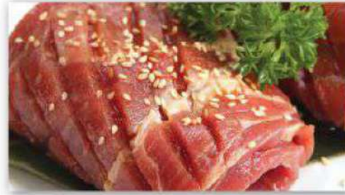
P3. 돼지 갈비 Dwaeji - galbi preserved pork prime-rib with seasoned soy sauce (150g/portion)