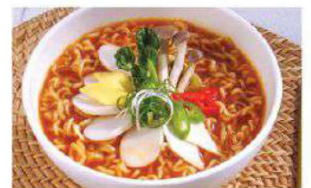
N6. 떡 라면 Tteog-ramyeon Korean instant noodle with rice cake