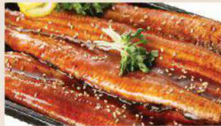
8. 장어 구이 Jangeo - gui marinated eel in seasoned soy sauce $20.00 (per portion) Original Price: $39.90