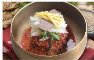
N2. 비빔 냉면 Bibim-naengmyeon spicy mixed buckwheat noodle (cold)