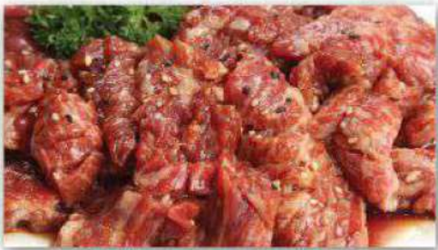
B2. 양념 갈비살 Yangnyeom Galbisaal marinated beef boneless short rib in seasoned soy sauce (80g/portion)