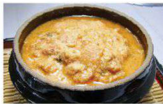
R4. 콩비지 찌개 Kongbiji-jjigae stew made with ground-bean, ripened kimchi and sliced pork