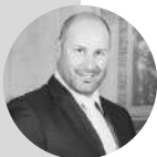
PRIMOŽ BRODNJAK Ambassador