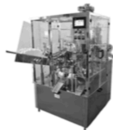
Processing Machine: Tube Filling Line Laminate / Al Tube Origin: India