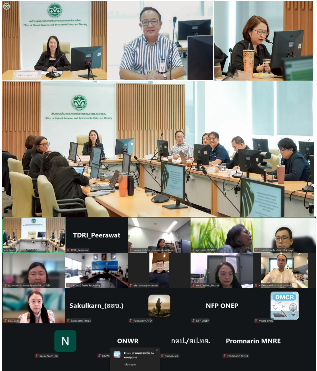
Figure 5 Project Steering Committee of the project “Integration of Natural Capital Accounting in Public and Private Sector Policy and Decision-making for Sustainable Landscapes” No. 1/2026 (24 March 2026)