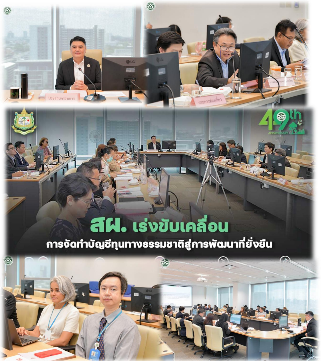
Figure 2 Project Steering Committee of the project “Integration of Natural Capital Accounting in Public and Private Sector Policy and Decision-making for Sustainable Landscapes” No. 1/2024 (22 February 2024)