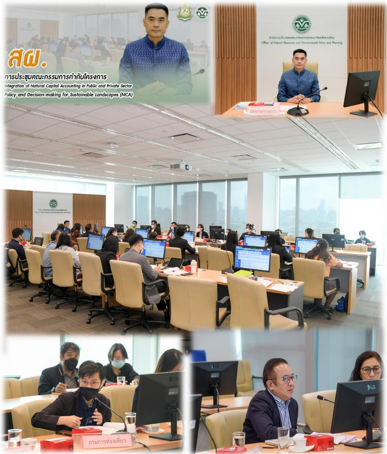
Figure 1 Project Steering Committee of the project “Integration of Natural Capital Accounting in Public and Private Sector Policy and Decision-making for Sustainable Landscapes” No. 1/2023 (9 February 2023)