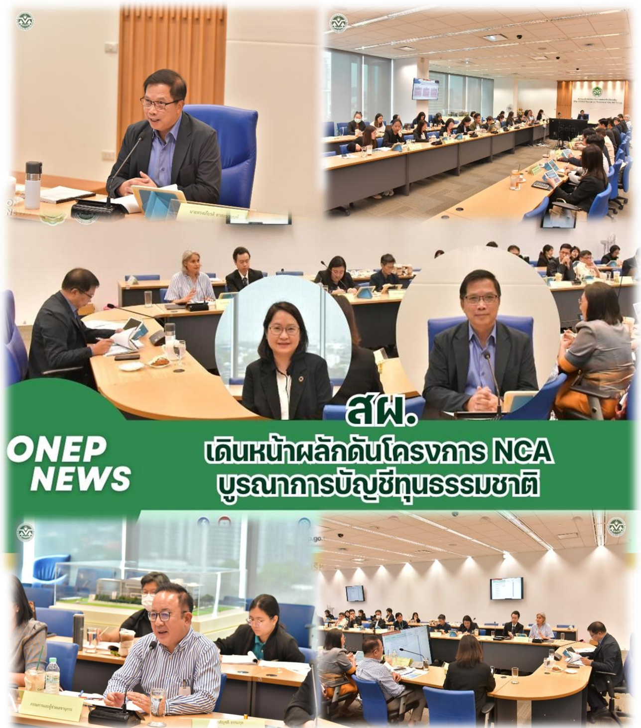
Figure 4 Project Steering Committee of the project “Integration of Natural Capital Accounting in Public and Private Sector Policy and Decision-making for Sustainable Landscapes” No. 2/2025 (21 August 2025)